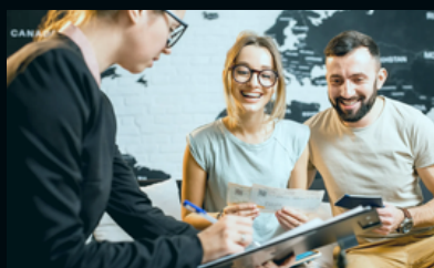
Travel & Tourism