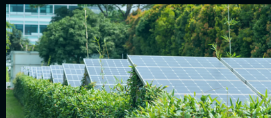
Renewable Energy & Sustainability