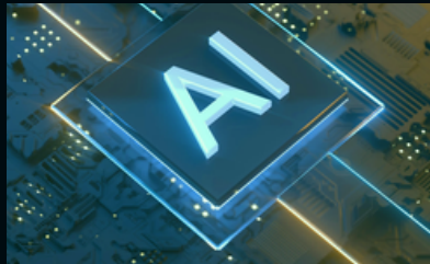
Technology & Information