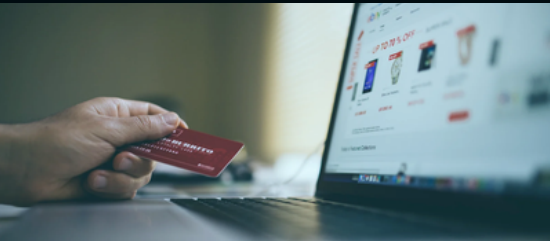
Ecommerce & Trading