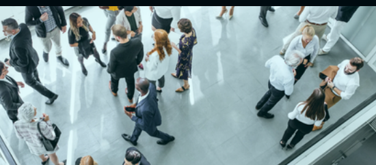
Sports & Event Management